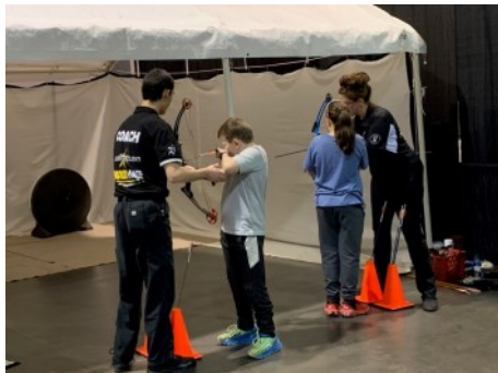
Archery Excellence - bring the kids to learn how to shoot bows with professional coaches