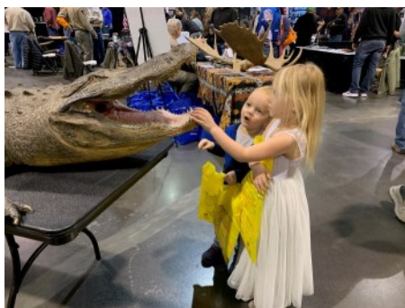
Sensory Safari Trailer is always a big hit.

Proceeds from the Expo, banquet, and auctions help us raise funds for various projects supported by our Kansas City Chapter and allows us to help fund the important work of Safari Club International in advocating for our right to hunt.