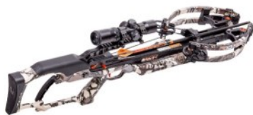
Raven Crossbow R10 Predator Camo