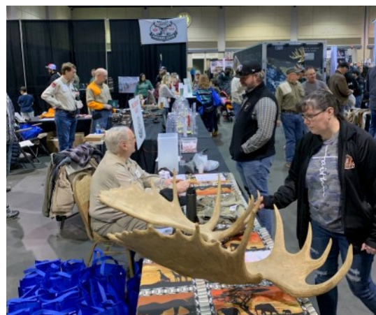
If you can help for a couple hours at the expo we can put you on the schedule, email admin@kcsci.com