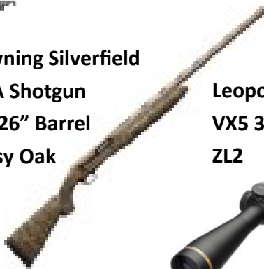
Leopold Scope VX5 3-15x44 ZL2